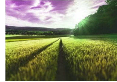
Environment and Agrifood