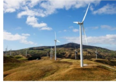
Energy and Power