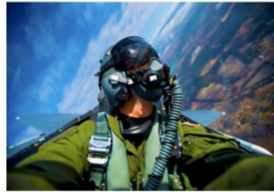
Defence and Security