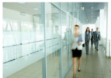
School of Management