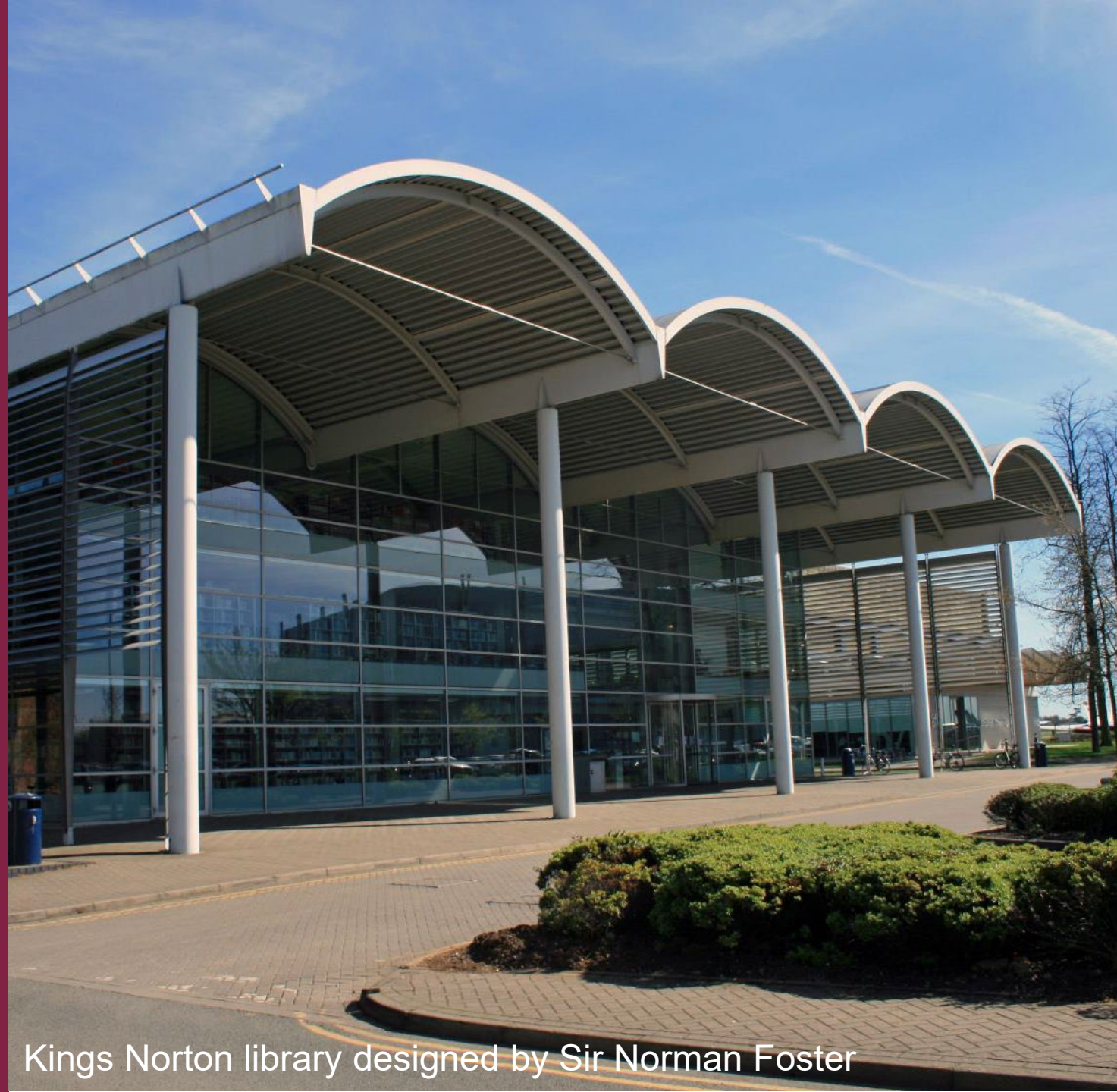
Kings Norton library designed by Sir Norman Foster

Cranfield has many world-class, large scale and national facilities that enhance the quality and value of our research and teaching. Learn more about them in the individual theme slides.